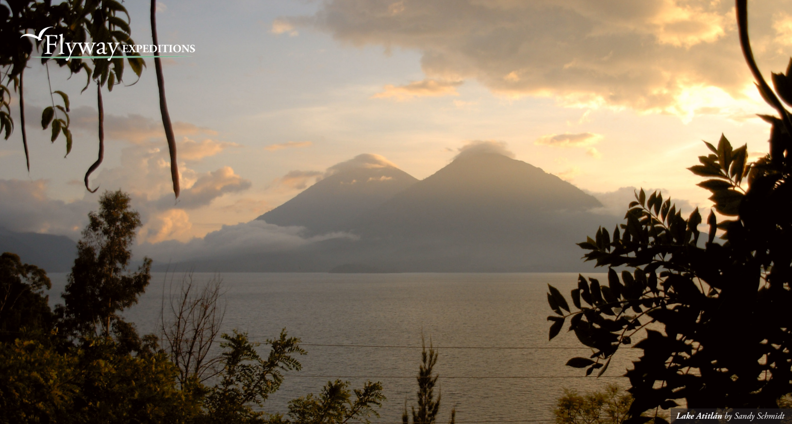
Lake Atitlán