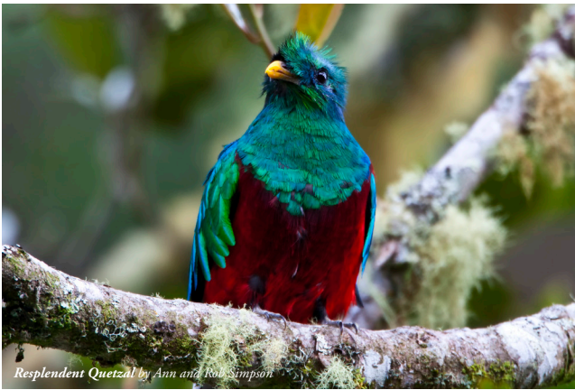
Resplendent Quetzal