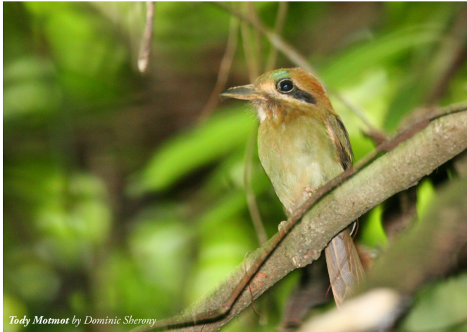
Tody Motmot by Dominic Sherony

and honey) and through providing tourism services. Sixty Maya Kaqchikel families live within the protected area, working in production of coffee and ornamentals, as forest rangers, and in tourism. Several enthusiastic and knowledgeable local guides show the bird and wildlife and explain the production of coffee and ornamental plants. Los Trrales is providing social services for the people living within the protected area. A private primary school is run in order to ensure the children's education. Classes in nature, science, and conservation are included in the educational program. Overnight at Finca Los Trrales. (BLD)